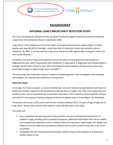
TFRI as a represented partner