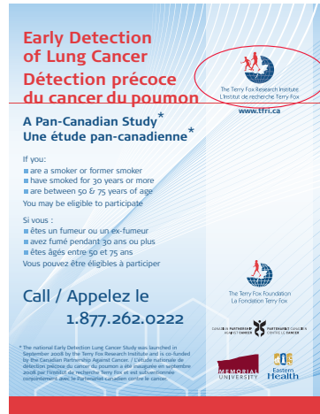
TFRI as a represented partner