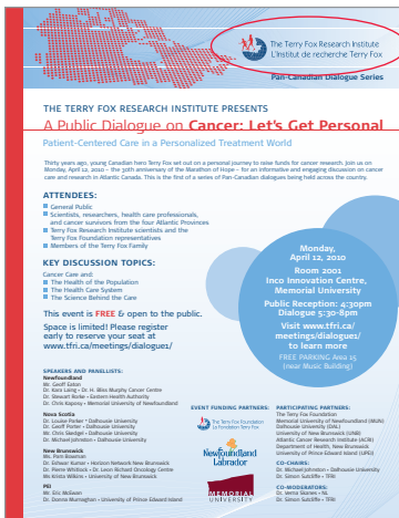
TFRI as the sole/primary sponsor/funder/initiator

Where TFRI is a represented partner (secondary or otherwise) or co-funder of a project, event, announcement, etc., we request that the logo guidelines regarding Logo Used in Conjunction with Other Logos (see page 5) be applied.